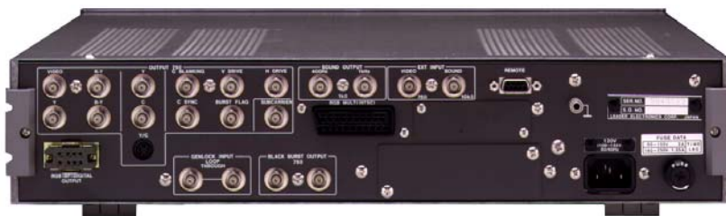
Rear Panel Models 408/408NPS (Model 408 Shown)