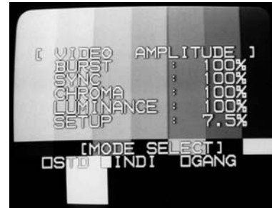
Full Menu Superimposed on Output Pattern

Microprocessor control and digital synthesis give the 408 and 408NPS extreme flexibility in test signal programming of both video and RF outputs. Signals available simultaneously include composite video, Y/C, Y/R-Y/B-Y, GBR, full sync generator outputs, audio test tones (400 Hz and 1 kHz) and modulated output from 30 to 900 MHz. Multiple test patterns include wide and narrow video sweeps and multiburst with last burst variable to 15 MHz. Signal modifiers include polarity inversion, superimposed circle and moving marker as well as on/off and level control of burst, sync, setup, luminance, chroma, R,B and G. Genlock and remote control are standard. GPIB is available as an option. The 408 operates in the NTSC system while the 408NPS extends all operating features into PAL and SECAM as well. Applicable video and audio modulation is selected by system designation. The FUNCTION DATA block provides easy access to all programming functions. Here, up to 100 test setups can be stored, each one holding front panel settings (pattern selected, genlock on/off, signal modifiers, etc.), tailored or standard video parameters, RF channel selected or tailored to any carrier frequency between 30 and 900 MHz. Program control over video parameters allow component values for Betacam or MII to be set up. The LCD panel shows partial programming menus, but the full menus may be superimposed on the selected pattern on a monitor screen.